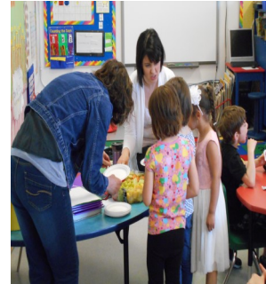
Students enjoying fruit for a morning snack during Healthy Living Week

We would like to thank the Parent Advisory Council for their continuous support in the Minitonas Early Years School. All the fundraising and hard work the parents put in this year the PAC was able to provide both schools with funds to order supplies from their wish lists. A BIG THANK YOU TO EVERYONE WHO MADE