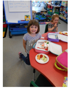
Students enjoying the Healthy Living Week Activity Stations on Friday!