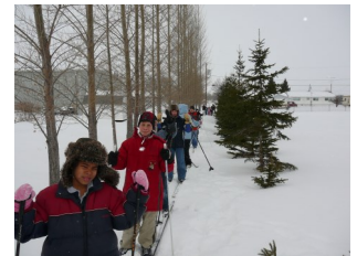
Winter fun at Heyes.