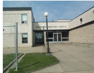
Main entrance at Heyes School. All guests to the school use this door.

Our co-regulation room aids in keeping our students feeling happy, relaxed and engaged.