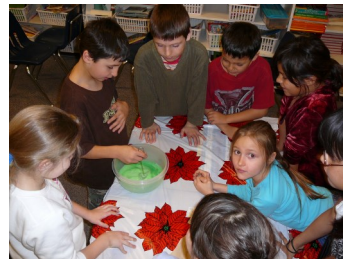
Homemade ice cream in class