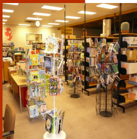
Heyes school library

Heyes school is committed to encouraging students to respect Learning, the Environment, Oneself and Others.