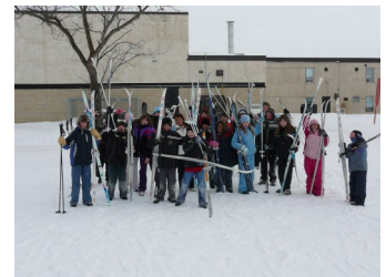
First attempts at cross-country skiing.

The sliding hill is a winter favorite. It is supervised by staff and selected students.