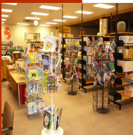
Heyes school library

Heyes school is committed to encouraging students to respect Learning, the Environment, Oneself and Others.