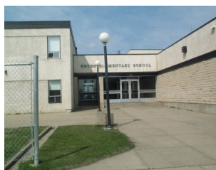
Main entrance at Heyes School. All guests to the school use this door.

All classes have ample time allotments in Music, Computer, and Physical Education classes. Library time is also scheduled in for each class, with additional access for individuals as needed.