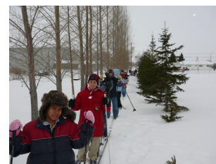
Winter fun at Heyes.