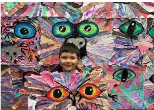
Grade 3C Abstract Art

CONGRATULATIONS TO OUR GRADE 3'S & 5'S FOR COMPLETING THEIR LEVELS OF SURVIVAL SWIM LESSONS!