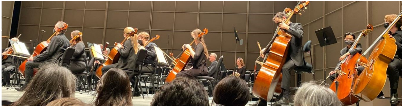
Regina Symphony Orchestra